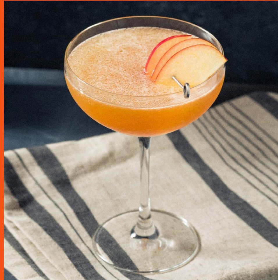
APPLETINI RECIPE, collaboration with Du Nord Social Spirits, 2022