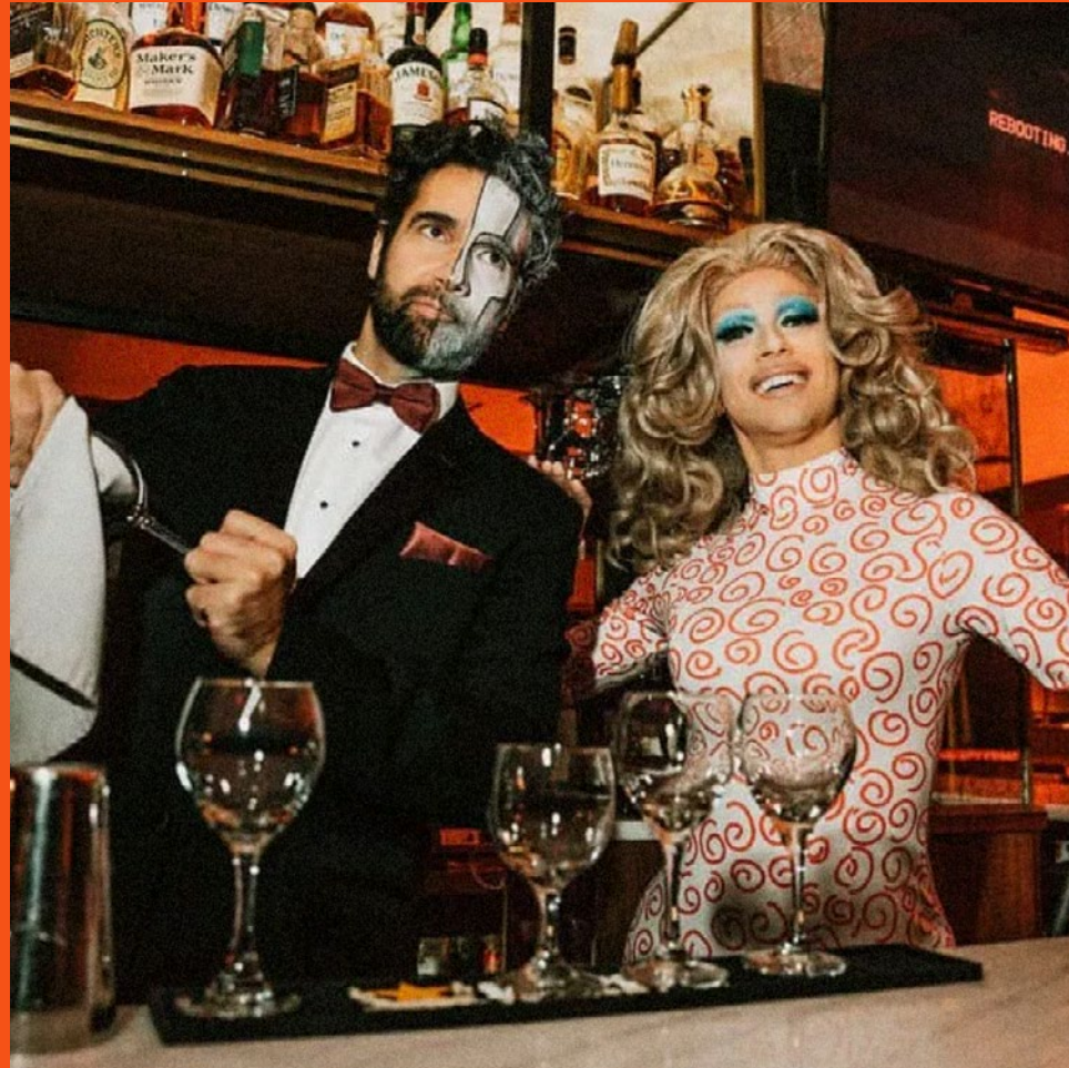
MATTE PROJECTS X LA BOMBA, Halloween 2022