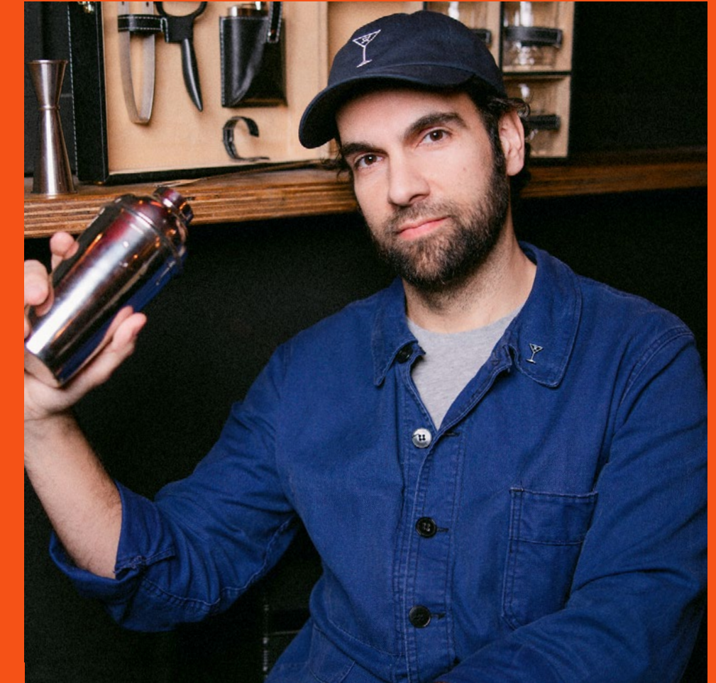
PRIVATE CLIENT BARTENDER, 2023