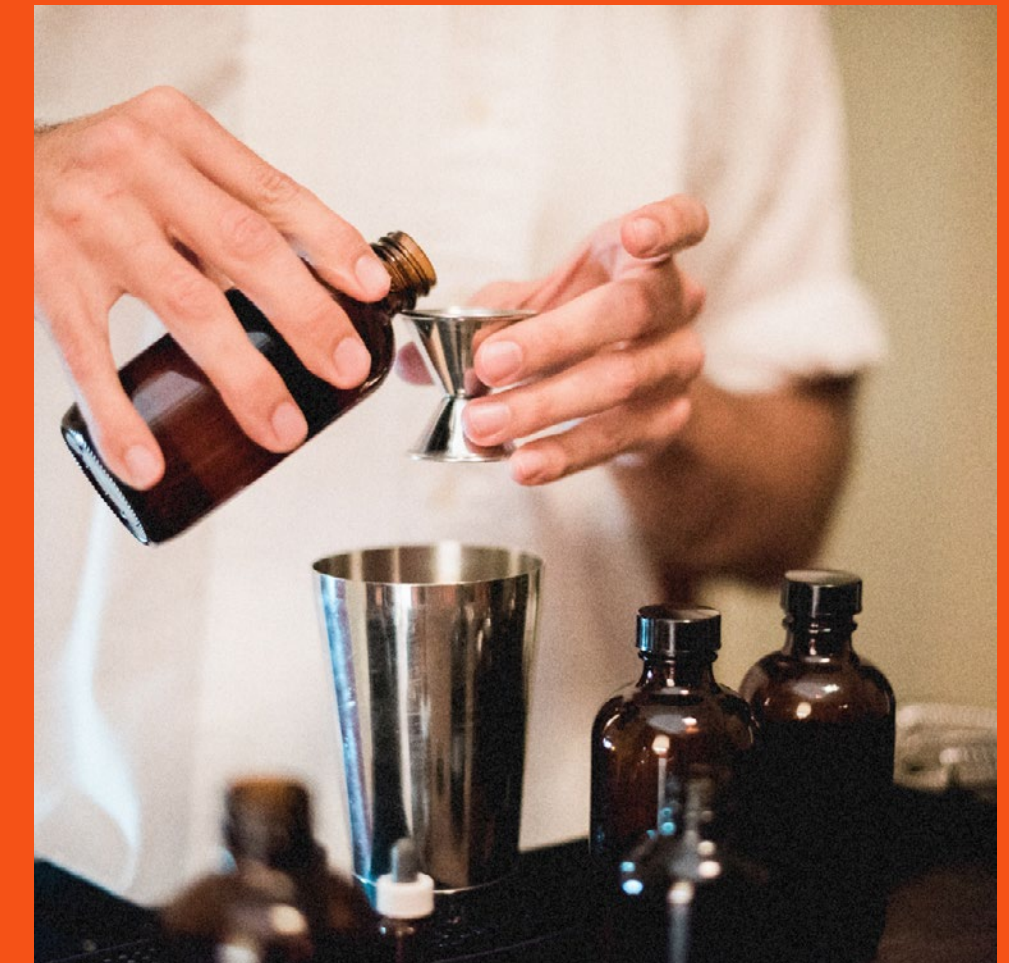
SIGNATURE COCKTAIL CREATION X ASPARAGANZA, Finger Lakes 2018