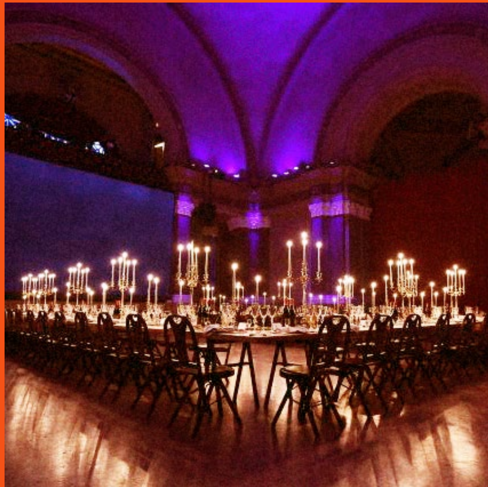
AQUA REGIA BAR FOR ONE X RAG & BONE, 2019